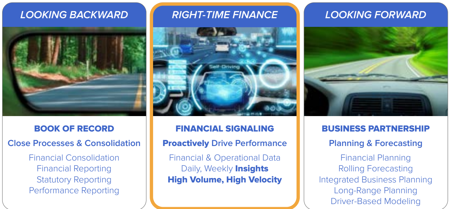
Figure 1: Financial Signaling

Sounds logical, right? But how do successful Finance teams make the leap? To start, when seeking to unleash their true value, Finance teams can't ignore the basics. They must instead conquer the complexity of basic processes — such as the financial close and planning processes — and be prepared to lead at the speed of the business.